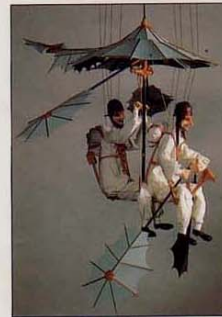
'The Large Umbrella Biplane'