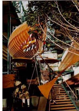
'Africa Queen II', 1989, commissioned for installation at the Braunsberger furniture store in Wels, Austria, length 11 m