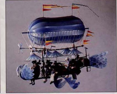
'Silver Swan', 120 x 70 x 40 cm