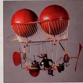
'The Adventure', 70 x 60 x 35 cm