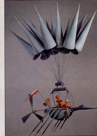
'The Imaginaire', 70 x 80 x 60 cm

which, when pulled, cause the pilots to turn their head, wave their arms or row. Other models are animated like marionettes from below.